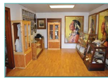
Star Valley Pioneer and History Museum

Joining together to encourage tourists to visit Afton and learn more about its history, four groups including DUP