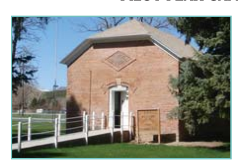
The DUP Museum in Enterprise, Utah

The Pilot Peak Camp , Washington West Company, Enterprise, Utah, has a small, one room Museum where they hold their camp meetings. The building was the first church/school building in the community of Enterprise, which was incorporated in 1896.