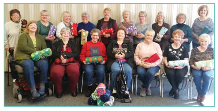
Greenwood Camp displaying comfort blankets.

The Daughters of the Greenwood Camp , Beaver Company, Beaver, Utah, donated over 30 new blankets to the Beaver County Children's Justice Center in February and March of 2019. They understood there was a need for these blankets, to give comfort to children who are brought to the Center. Without a specific number of blankets as a goal, the women chose this service project over a few other options. The response was amazing — 30 new blankets to go to children facing difficult situations. Members of the Greenwood Camp made two deliveries to the Center, both times being generously thanked by the Director.