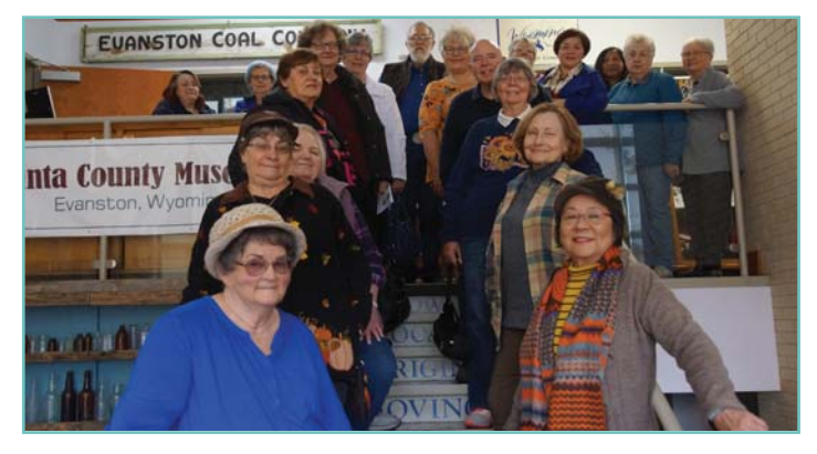
Wyoming visitors and members of the Chinese Descendants Association in the Uinta County Museum.

The Uinta County Museum is going the extra mile to preserve the area's history and also the Chinese Joss House. The bringing-back-to-life of the Railroad Roundhouse is a notably great undertaking of the whole community. Riding the railroad turntable was a highlight for the visitors. Many of the visitors said they would like to return to Evanston for another visit.