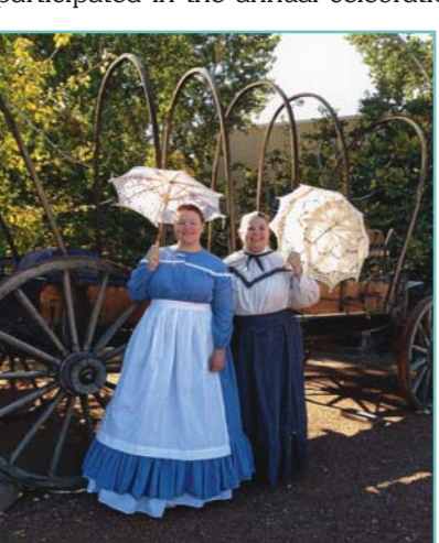
DUP Daughters participate in Nevadaween Celebration

Clark Centennial Hills, Clark Desert Springs and Clark Legacy Meadows Companies of Southern Nevada, participated in the annual celebration of "Nevadaween." This