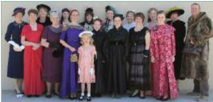
Participants in Caribou County Company Fashion Show