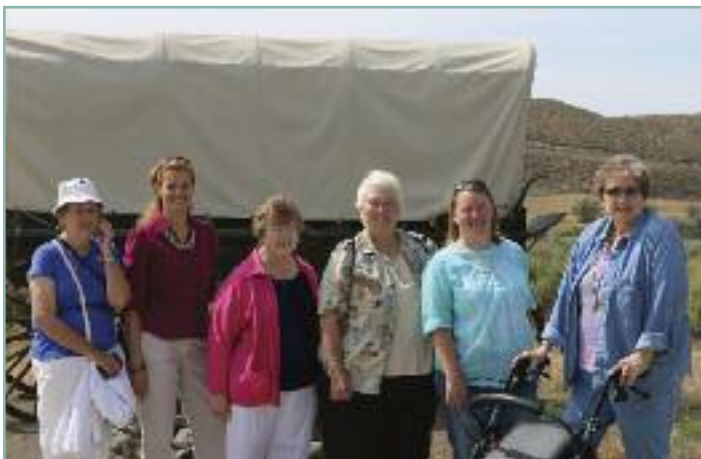
High Desert Drums Camp members visited Three Island Crossing State Park

Following a picnic lunch near the river, the daughters toured the Historical Museum in Glenns Ferry, which is housed in the location of the old schoolhouse.