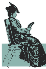
Photo CDs are sent separately, immediately after the lesson is mailed.

Lesson orders are sent about one month prior to date of use. Any changes to the recipient of the lesson or to her address needs to be received by ISDUP two months prior to the month the lesson is to be given.