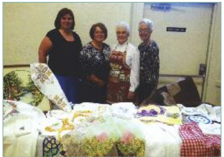
Steed Creek Daughters showing some of the handwork pieces their pioneer ancestors created.

The Fair was attended by over 75 daughters and guests. For summer fun, don't forget the Charles Penrose Cabin, located behind and to the east of the Rock Church on Farmington's Main Street.