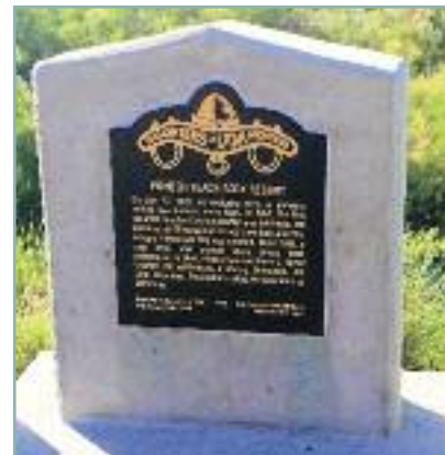
Black Rock Resort Marker #118