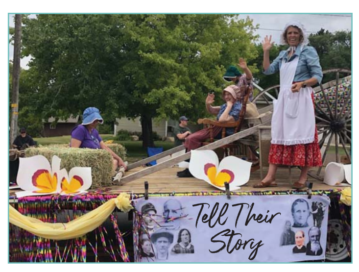
South Weber Camp's parade float.

With summer approaching soon and plenty of time to prepare and plan, consider being part of your community parade celebrating the pioneers. The South Weber Camp made a simple float along with their own homemade signs and entered it into their local parade. Pass along cards were given out alongside of the moving float advertising DUP and how to join. What better way to introduce and pass along the excitement of our pioneer ancestors. At the end, the camp members said "This was fun. Let's do it again next year!" Outreach is wonderful!