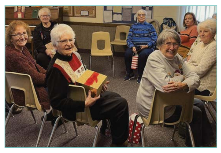
Indian Paintbrush Camp Daughters enjoy their Christmas party.

The Indian Paintbrush Camp , Minidoka Company, Rupert, Idaho, met on December 12, 2022, for their annual Christmas Meeting and Party. Out of 16 active daughters, 12 were in attendance. The day consisted of a regular meeting and lesson presentation, followed by a baked potato bar and custom-made cupcakes. Members then participated in a gifting game where one member read the story called "The Two Gifts." On the words "Snowy" and "Hungry" in the story, everyone passed a gift to either the left or the right. At the end of the story, whatever gift had stopped at your chair was yours to keep. The Board chose and presented to each daughter the 175-year pin from the ISDUP. Everyone enjoyed the day's activities.