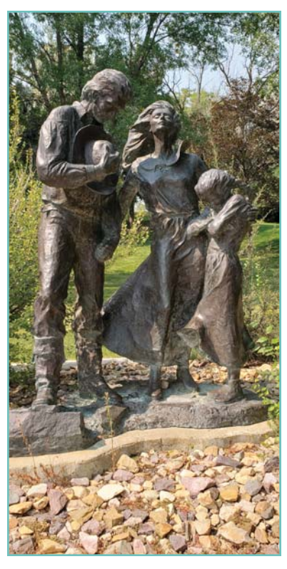
"Pioneer Family: An Everlasting Heritage" Statue

This statue of a pioneer family was on display for many years at the Kanesville Tabernacle and Visitors Center in Council Bluffs, Iowa. Due to the recent updates at the