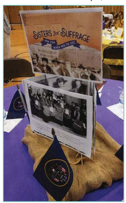
Sisters of Suffrage table decorations.

The Davis Bountiful East Company waited two long years to celebrate the anniversary of the right for women to vote. The result was an epic, fantastic Jubilee with a huge