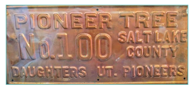
Plaque honoring the trees planted in the Great Salt Lake Valley.

The DUP shifted emphasis from tree markings to tree plantings. Trees were planted on the Utah State Capitol grounds for each DUP President. Individual camps and companies honored trees they planted in parks and on church grounds (with permission).