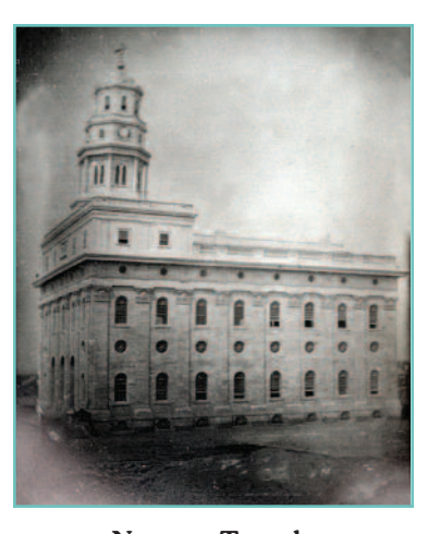
Nauvoo Temple daguerreotype, circa 1847

In October of this year, the Pioneer Memorial Museum was the location of a film crew working on a spot for The Church of Jesus Christ of Latter-day Saints website. The production brought in lights, rails, cameras, actors, and monitors to the second floor of the museum. The setting replicated the Cedar City DUP museum where the original discovery took place in 1997 of a daguerreotype, the only known photograph of the Nauvoo Temple. In 1998, the Church conserved this delicate item.