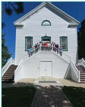
Cotton Mission Camp members at Pine Valley Chapel.

Daughters in the Cotton Mission Camp , Washington Company, St. George, Utah, have been visiting DUP markers throughout Washington County. The historic tours began in September of 2022 and continued monthly every third Monday. Each tour included a history of the monument's location and visits to special pioneer buildings, museums, and cemeteries in that area. This was a great learning experience for the camp members to connect to early settlers. Many members used the information to share with family members and friends from out of town. This activity brought in many members new to our community who wanted to learn more about the area.