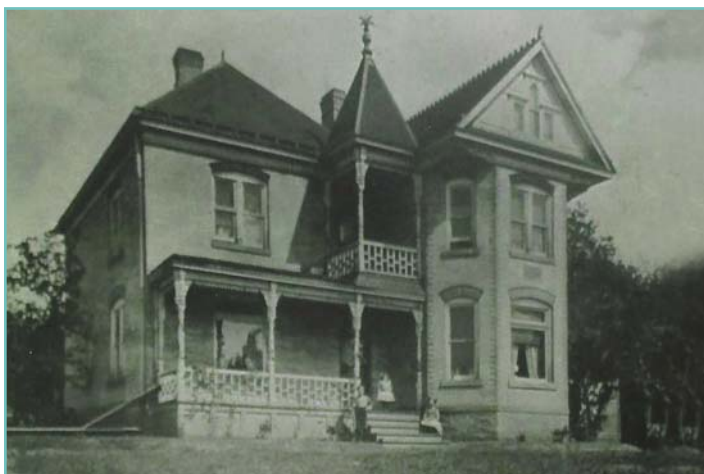
The John Neff Pioneer Home.