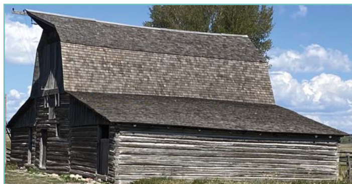
One of the structures on Mormon Row located in Grand Teton National Park.

On September 11, 2023, 10 members of the Silver Star Camp , Lincoln Company, Star Valley, Wyoming, traveled to Mormon Row. It is located in Grand Teton National Park and got its name from the fact that the 27 Mormon homesteaders who settled there clustered their farms to share labor and community. These settlers arrived in the late 1890s and early 1900s from Idaho. They were descendants of the early pioneers who traveled to Zion in the mid 1800s. These hardy settlers dug ditches by hand and with horses, built an intricate network of levees and dikes to funnel water to their fields. The famous, picturesque Moulton barns highlight Mormon Row, with the Grand Tetons in the background. The weather was beautiful and the ladies had an enjoyable day in the wonderful scenery.