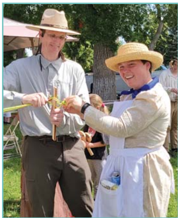
Pioneer Game demonstration at the 24th of July Celebration.

The Uintah Company , Utah, held a 24th of July celebration at the Vernal Pioneer Museum. Volunteers demonstrated homesteading skills, helped the attendees try their hand