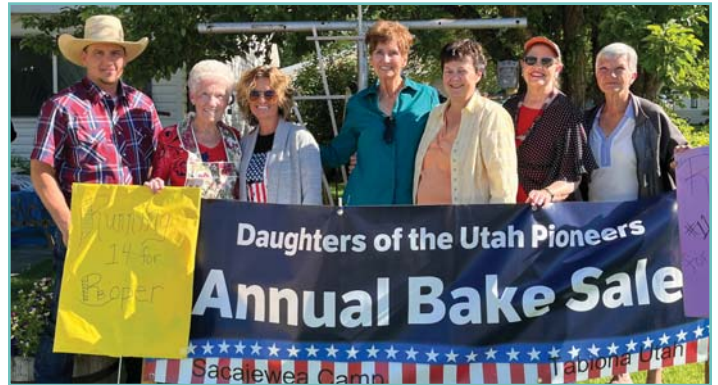
Sacajawea Camp Bake Sale Participants.

In 2010, the Sacajawea Camp , Duchesne Company, Utah, had a cabin that early company members built. The cabin needed to be moved, and it became the new location for the camp's monthly meetings. The daughters held a raffle and a bake sale during the 4th of July town celebration to raise the needed money to move the cabin. This was a huge success, and not only could the cabin be moved, but the bake sale has turned into a wonderful tradition that is still going strong. The money earned from the bake sale helps pay the DUP member dues. There are many repeat customers who look forward to the delicious baked goods provided by the daughters of the Camp.