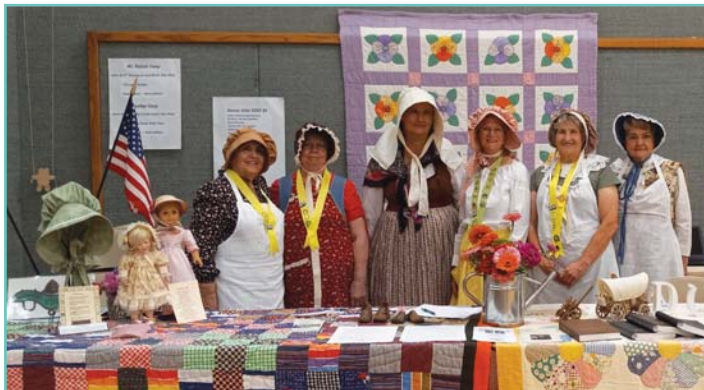
Puget Sound South Company Daughters at their booth during a local Preparedness Fair.

The Puget Sound South Company , Washington, participated in a pioneer preparedness fair held August 5, 2023, in Graham, Washington. The daughters had a booth which included pioneer games, butter making, wheat grinding, and a display of DUP books and posters about DUP.