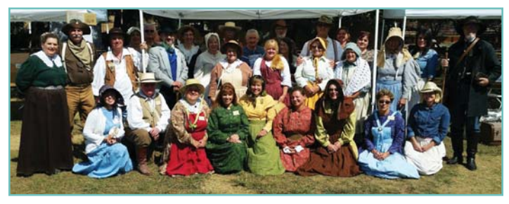
Participants at the Mini Miner's Day Celebration

Several members of the California El Dorado DUP Company dressed in pioneer attire and joined with members of the Sierra Nevada Mormon Pioneers organization to help