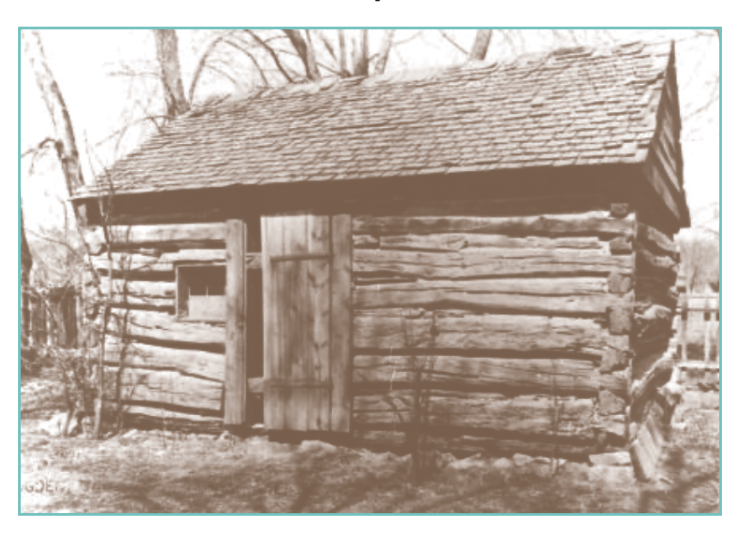
The Miles Goodyear Cabin in Ogden, Utah.

The next time your camp is in the area, plan to the visit the Museum. It is well worth the trip.