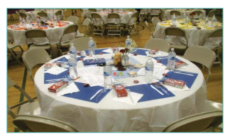
One of the tables at Salt Lake Canyon Trails Jubilee.

"Past Times — Then and Now" was the theme of the Salt Lake Canyon Trails Company Jubilee held on May 22, 2023. Checkers, embroidery, marbles, jacks, hoppy taws, a well-used wagon, hankie babies, buzz saws, button-button, puzzles, tops, Jacob's ladders and yo-yos, were all either on display or available to try (if you remembered how) or were the centerpiece of each dining table. Tongue twisters and bingo games graced each place setting along with "Cracker Jacks" as an individual favor. Sloppy Joes and various salads were the main course with lemon bars and brownies for dessert. A fun time was enjoyed by all in attendance.