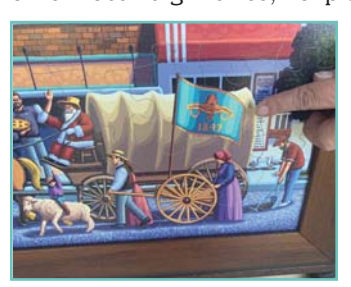
Enlarged photo of the DUP flag attached to a covered wagon.

On June 27, 2022, representatives of the Utah South Center Company in Spanish Fork were invited, along with other local dignitaries, to place the final pieces of an Eric