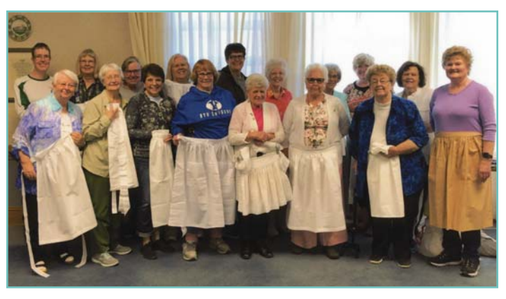
Moreland Trail Camp Daughters