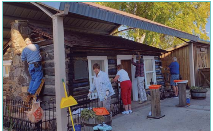
Many hands work to preserve the Gowans Cabin