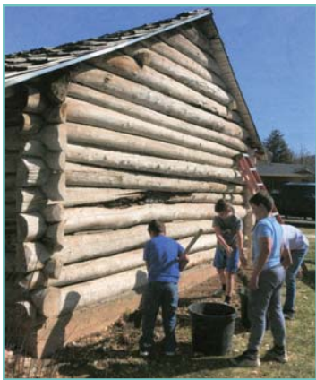
Everyone helped to spruce up the Birch Camp Cabin

The Birch Camp , Juab Company, Utah, is busy renovating their cabin. When the pioneer cabin was inspected they found some termite damage and other aging problems. With the help of grandchildren, sons and husbands, they cleared out the cabin and are repairing and freshening it up from the inside out. Family members have cleared the brush around it and are busy sprucing it up and getting it ready for a reopening in June. Markers are also being replaced.