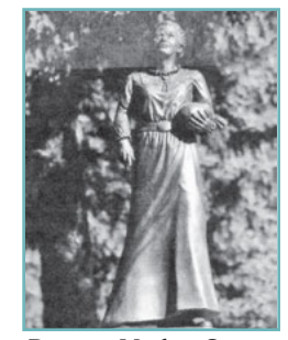
Pioneer Mother Statue

Members of the Carbon Company DUP enjoyed a fun birthday party at the Pioneer Park in Price, Utah. The daughters had worked for a long time to raise funds for the pioneer mother statue which is standing south of the pioneer cabins. They commemorated the special day with a picnic and socialization.