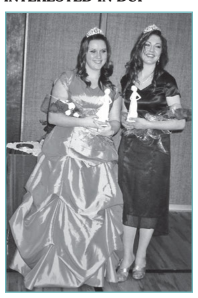
Two Queens were selected at the Pioneer Young Women of Today pageant in Idaho

paid by contributions from individuals in camps and companies.