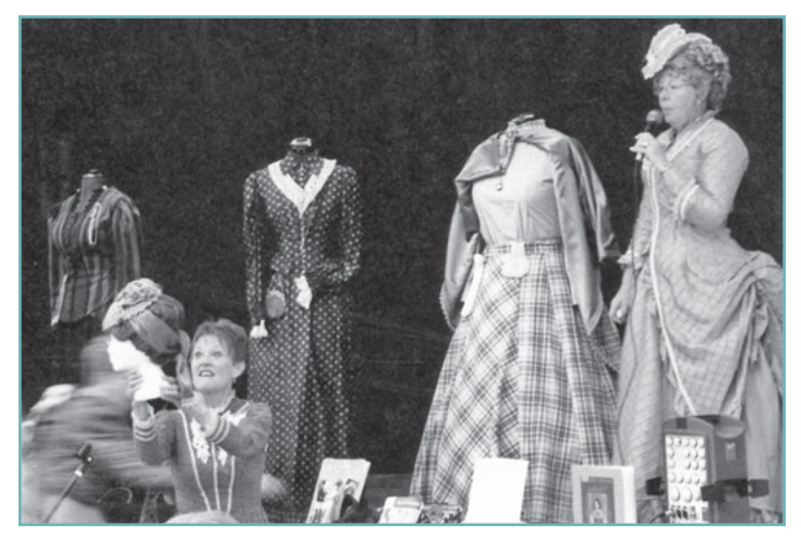
Daughters attending the Washington East Company Jubilee were treated to a display for Pioneer clothing.

They also toured the Washington City Pioneer Museum and marveled over so many artifacts of the past. The oldest Utah Relief Society Building still standing was also toured. This building is where Mulberry Camp holds their monthly meetings.