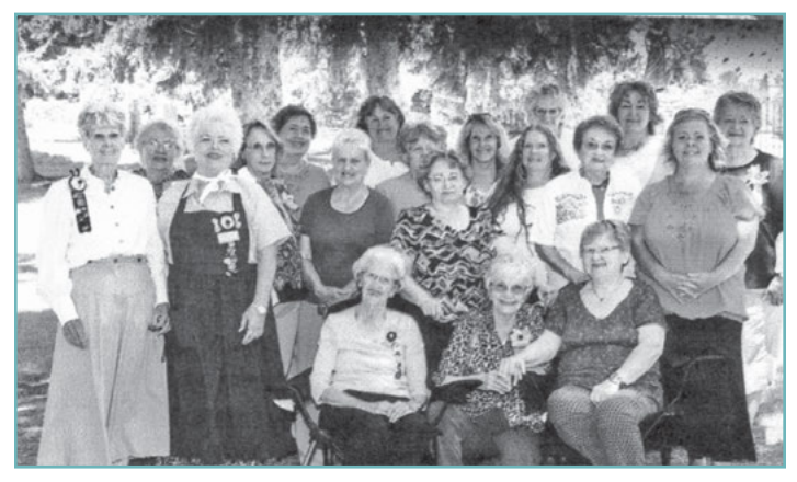
Daughters attend Brigham Young's Birthday party in Price