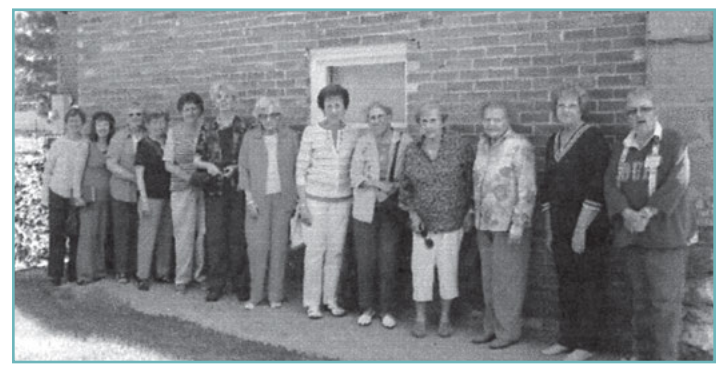
Members of Mueller Park Camp visit the Thomas Whitaker Home Museum

Members of the Mueller Park Camp enjoyed learning more about the way of life and artifacts from this early pioneer era including the weaving of wool and silk. It is believed that the Whitakers were one of the first families in Utah to raise silk worms. The Museum, now on the National Registry of Historical Places, is open for tours every Tuesday or by appointment at 168 North Main Street in Centerville.