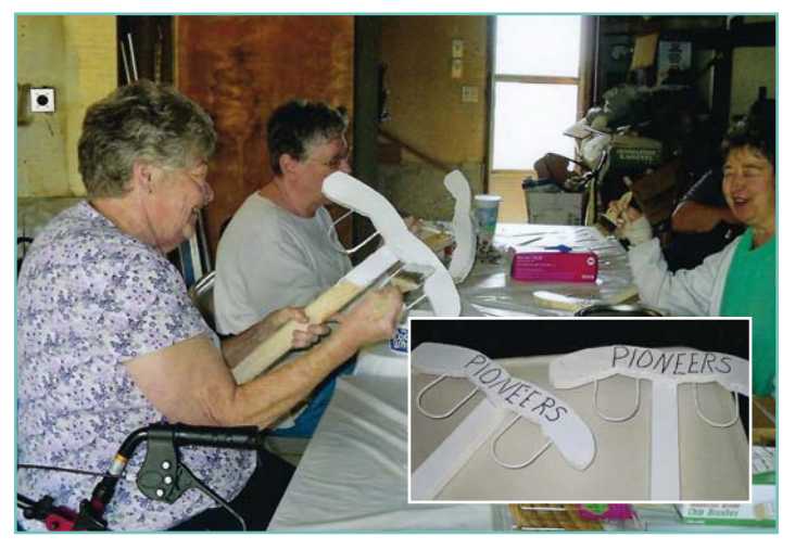
Members of Box Elder North Honey Bee Camp hard at work on their tombstone markers.

In the spring of 2017 the Honey Bee Camp , Box Elder North Company made tombstone markers for the pioneers interred at the Honeyville Utah Cemetery. The camp placed the markers on the graves this past Memorial Day weekend. After the holiday the markers were gathered up and now every year the camp can place the markers back on the graves. Bryon Bingham along with Mr. Banner cut them out and placed the wire in them for use.