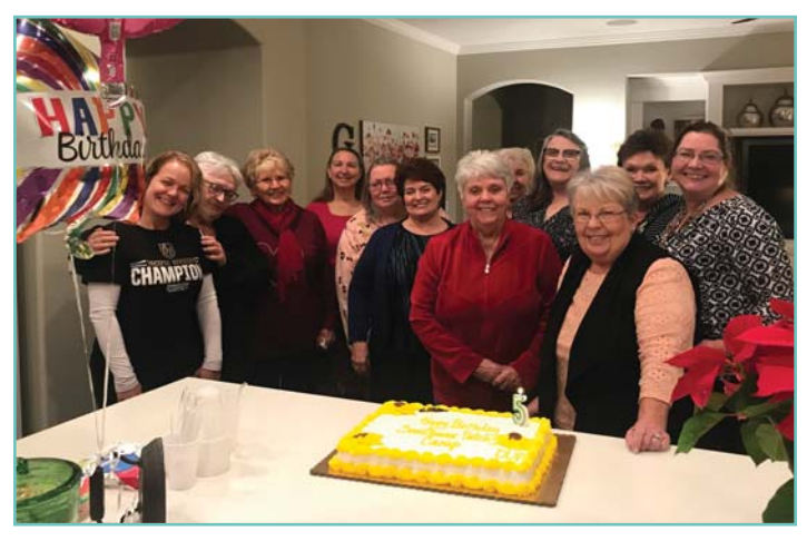
Happy birthday to the Sunflower Patch Camp members.

Sunflower Patch Camp , Clark Desert Springs Company, Las Vegas, Nevada celebrated their 5th birthday January 8, 2019. After the meeting, the camp celebrated with a birthday party. We Love DUP and enjoy the Legacy .