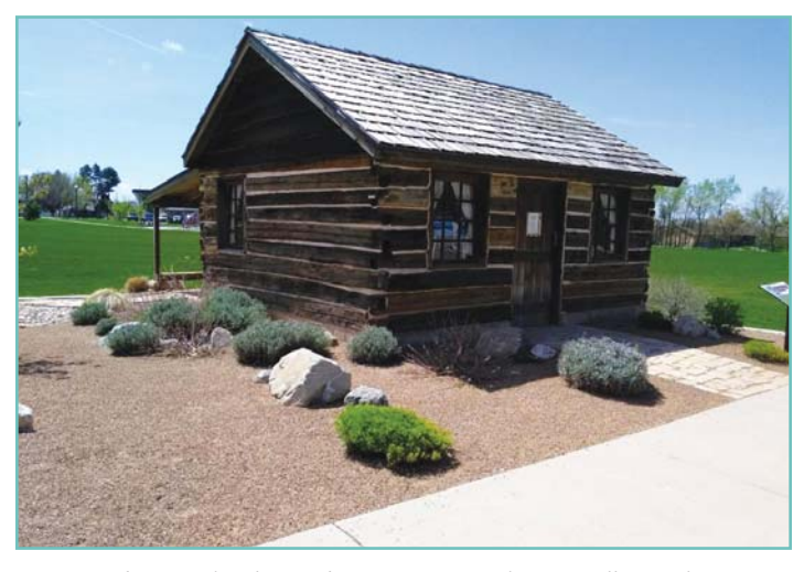
Adams Cabin located in Heritage Park, Kaysville, Utah.

laundry, make rag dolls, play games, discover the Deseret alphabet, and take time to imagine how their lives might have been had they lived in that era. There were more than 900 visitors during 2018. It was gifted to Kaysville City and the Kaysville DUP ladies volunteer with the teaching and activities.