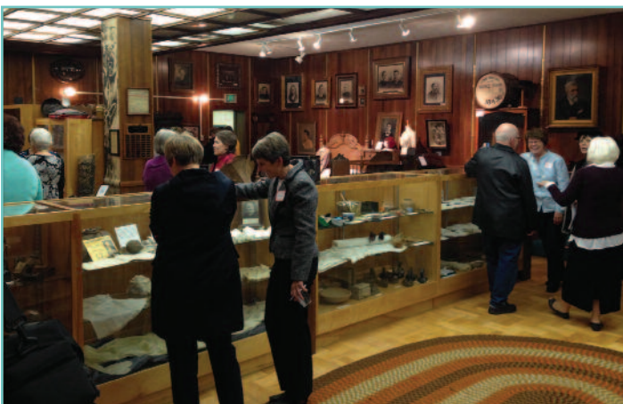
Interior of the DUP Cache Museum in Logan, Utah

A well-attended open house for the DUP Cache Museum in Logan, Utah was held on November 18th, featuring new updates and changes. The daughters are very proud of what has been accomplished and wanted the community and DUP members to come and see what has been done. The staff, executive members, and colleagues have worked hard with amazing results. Come and learn about the settlement of Cache County at this historic museum. The museum is located at 160 N. Main St., Logan, Utah. Hours: Tues.-Fri. 11 a.m.-5 p.m., Wed. 5-8 p.m. For tours, call 435-752-5139.