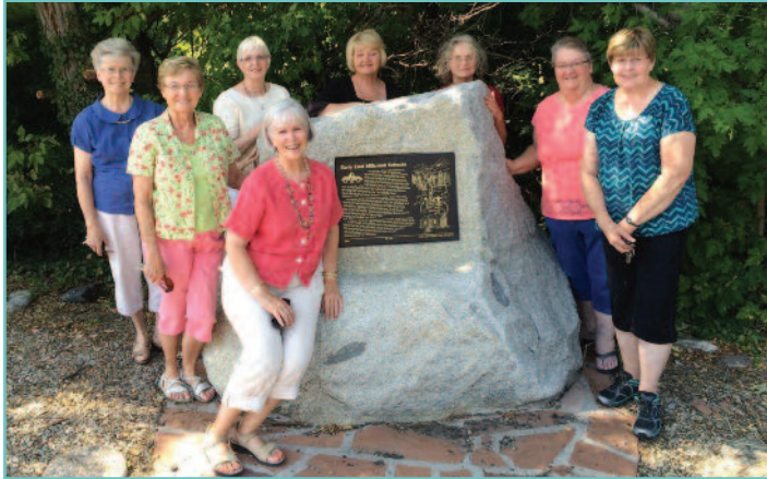
Members of Salt Lake Canyon Trails Company with their newly cleaned “Early Millcreek Schools” Marker