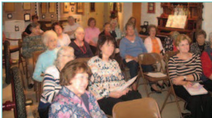
Members of Fiddler's Creek Camp attend a Camp meeting at the Layton Heritage Museum