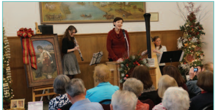
Musicians and vocalist entertain at the ISDUP Christmas Program