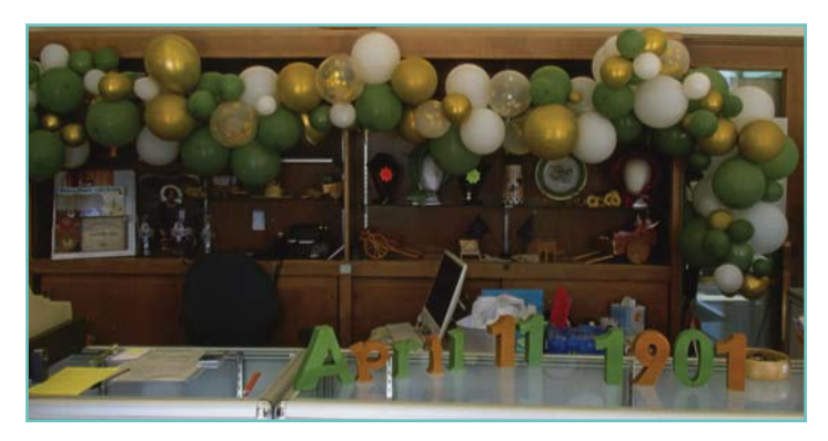
Museum decorations for the 122nd Birthday Party.

The 122nd Birthday of Daughters of Utah Pioneers organization was celebrated on its founding day, April 11, 2023, at the Pioneer Memorial Museum. Surrounded by sage green and gold balloons, the ISDUP board members greeted visitors, answered questions, engaged in conversations, invited ladies to join, and had many memorable photos taken. The visitors learned information about DUP by reading interesting posters. As they left, they were treated to cakes or brownies with a sticker announcing "Happy 122nd Birthday ISDUP." Balloons, cake, and friendship made it a successful celebration. Mark your calendars for April 11, 2024, for the 123rd DUP Birthday celebration! Plan on attending.